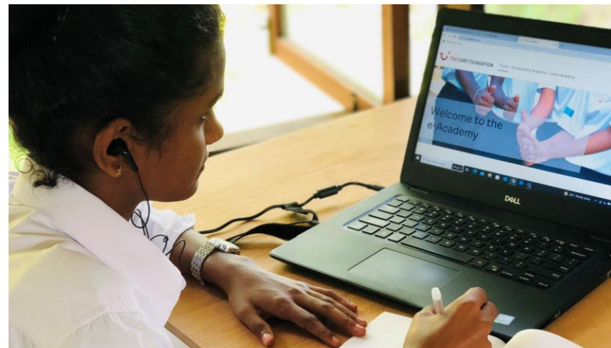
e-Academy student in Sri Lanka

The programme offers vocational education and sustainable career opportunities to young people from vulnerable communities. With a combination of theoretical education and life skills coaching, the programme focusses on the potential of tourism as an established driver of global job creation and growth. Each destination programme is unique and offers various qualifications. At the moment the TUI Care Foundation supports TUI Academies in the Dominican Republic, Sri Lanka and Greece amongst others.